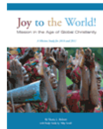
Current Issue Mission Study

SOCM. Also available are texts of these mission studies designed for youth study.