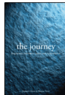
Spiritual Growth Study

These three texts are the current mission studies for School of Christian Mission 2011. These texts may be ordered in advance of SOCM by calling 1-800-305-9857 or ordered online at www.missionresourcecenter.org . They will also be available for purchase at